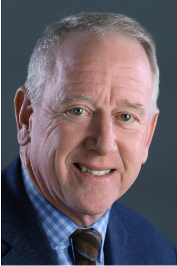
Featured Keynote Speaker Archie Manning All-American Quarterback and NFL Icon

Tuesday, October 6, 2020 | 5:00 PM | Lancaster County Convention Center