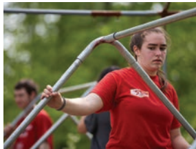
Above are some photos from our Spring Ordeal.