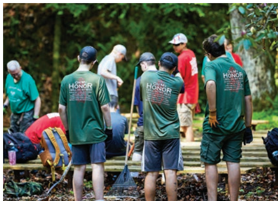
Fall 2022 Owl's Nest