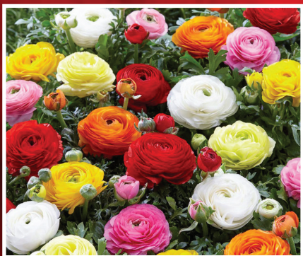
Item "M" Ranunculus