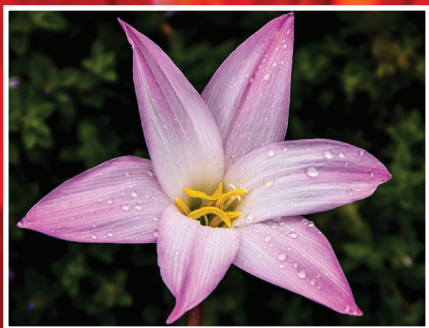
Item "K" Pink Rain Lily