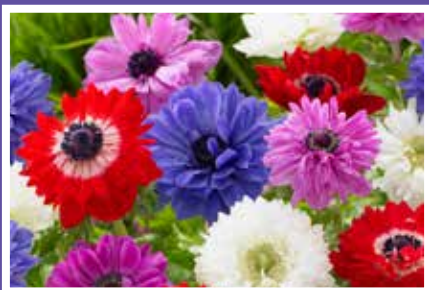
Item "E" Anemone St. Brigid