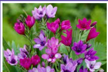
Item "Q" Baboon Flower Mix