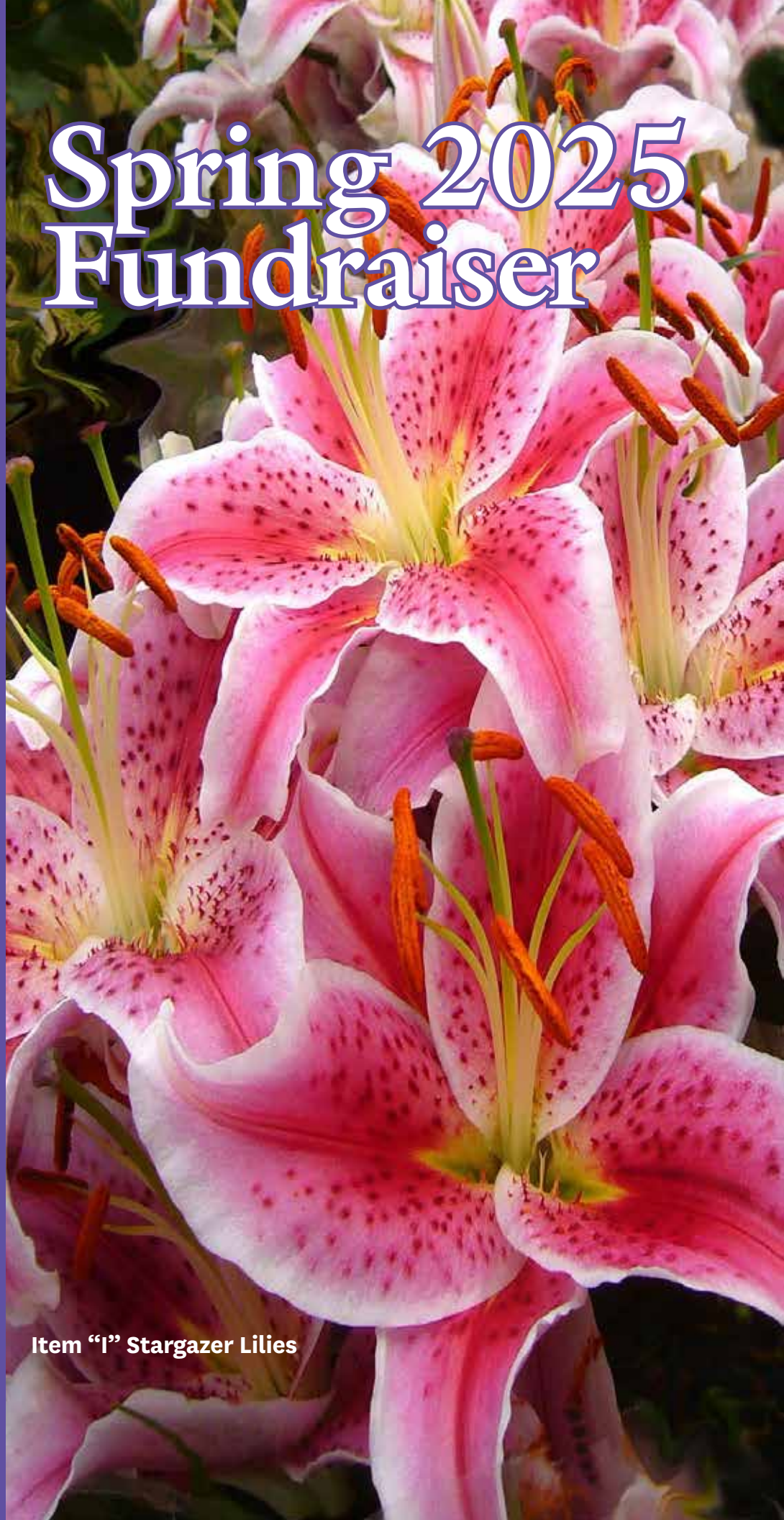
Item "I" Stargazer Lilies