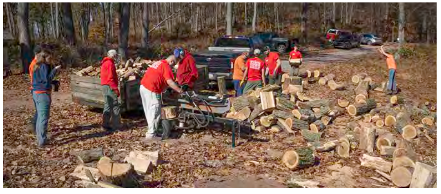
Thanks to Friends of Camp Mack for being our 2024/25 Newsletter Sponsor

As a reminder, the Lodge has an official refund policy that applies to all events the Lodge hosts. If you register for an event, but cannot attend and cancel before the registration deadline, you will receive a full refund. If you notify us that you cannot attend after the deadline, but before the day of the event, you will receive a refund of your registration fee less the identified food cost for the weekend. If you notify us the day of the event that you cannot attend or just do not show up to the event, no refund will be issued.