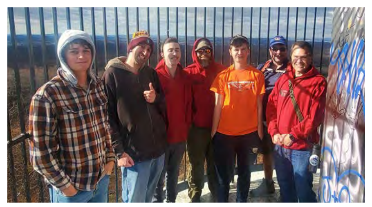
On Saturday, November 16, both chapters gathered at Governor Dick Park in Mt. Gretna for a hike to the top of the tower.

Keep your eyes out for upcoming Chapter events.