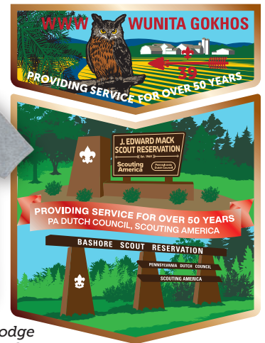
NEW Lodge Service Flap Set