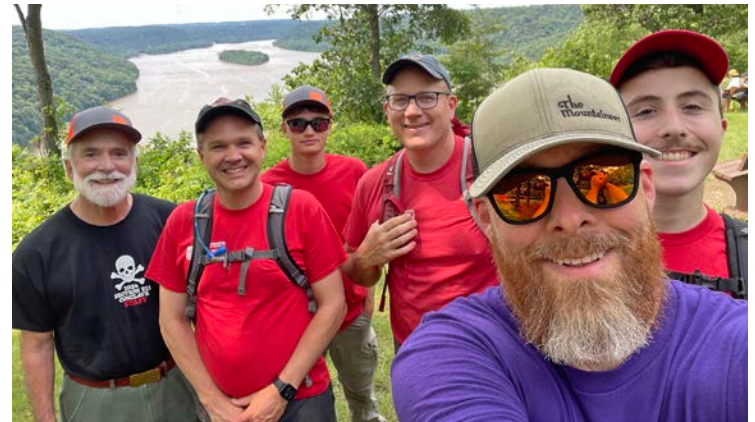
Kellys Run Chapter Meeting Hike – It was a great day for a hike! On Sunday, June 1, the Iron Forge and Susquehanna District Chapters went for a hike at Kellys Run Nature Preserve in Suthern Lancaster County.

Keep your eyes out for upcoming Chapter events.