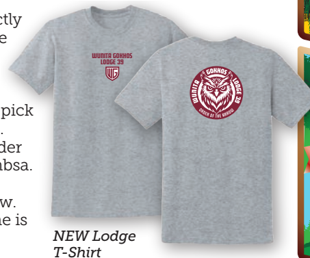
NEW Lodge T-Shirt

All proceeds from the sale of these items will go directly towards our Lodge Service Project Fund. Pre-Order your Fundraising Merchandise and pick it up at Fall Ordeal. Place your pre-order online at: padutchbsa.org/programs/order-of-the-arrow . Pre-Order deadline is Friday, Sept. 12.