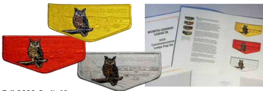
Fall 2020 Owl's Nest

We hope you will support the Lodge's Camp Improvement Fund through this awesome looking patch set! Patch sets will be available for pickup at the Fall Ordeal 2020 or at the Council Office in October, or will be mailed to you at an additional cost of $10.00 via Priority Mail. Patches will only be available for order through the registration system at padutchbsa.org/programs/order-of-the-arrow .