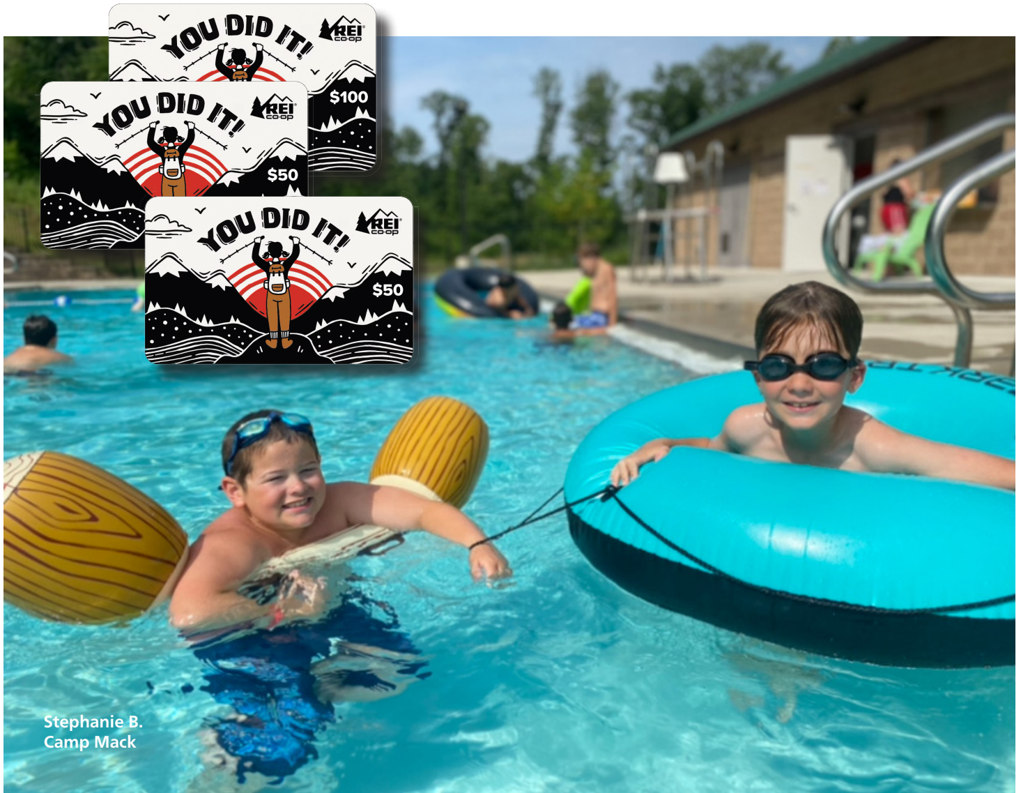
Stephanie B. Camp Mack

Take your camera to summer camp and send us your best photos! Capture your 2025 summer camp experience at Camp Mack (Cub Scout Weekend or Week-Long Resident Camps) or Camp Bashore (Scouts BSA Camp) and show us what you liked best about going to summer camp!